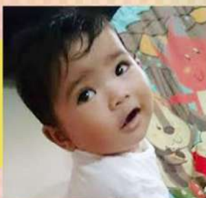
Mdm Fairuz 's Princess